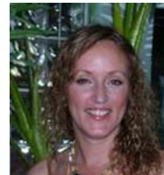
Joy Adler & The Souls of Evolution

Learn what science has been discovering about happiness, and how biofeedback and mindfulness dramatically enhance happiness levels. The pursuit of happiness has the tragic propensity to bring great misery if we pursue the wrong things. Discern worthy happiness pursuits to dramatically increase peace and happiness.