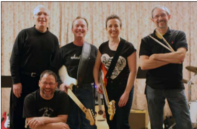
GB5 will play at the FUN Dance for all ages on Oct. 1.