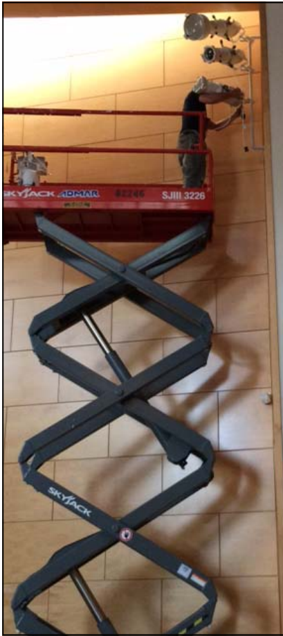
Installing stage lights on high!

which you will see if you look around. A new speaker in the upstairs hallway (not installed yet, coming soon!) will improve the listening experience for those who choose to sit up there and watch thru the lobby window. And another device will help those on the stage and at the lectern to hear better, too.