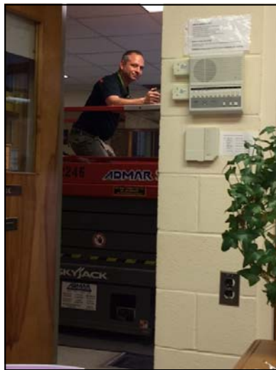
Lift, heading home at end of the day.