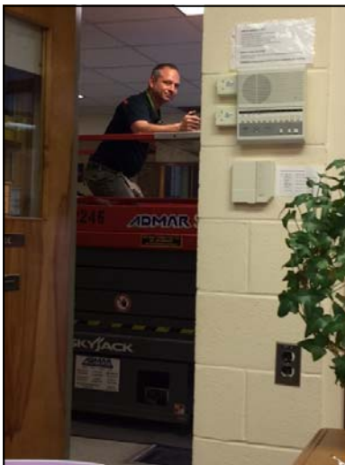
Lift, heading home at end of the day.