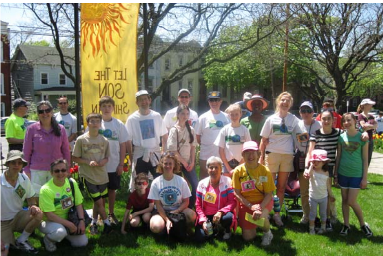
FUUSA CROP Walkers...