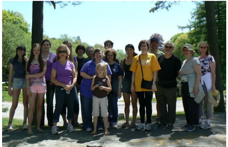
And the Rite of Passage mentees and mentors who did the Walk!

Final pledge data is trickling in, but it looks like Team UU raised about $4,800 in pledges, plus extra funds TBD under the Feinstein Challenge.