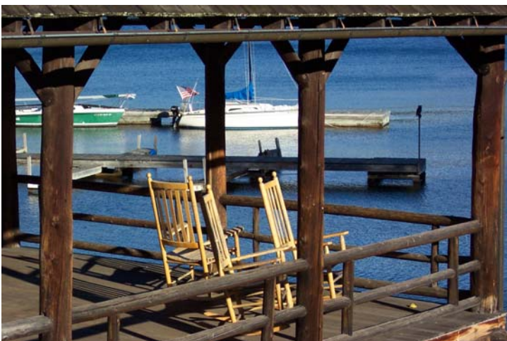
One of these chairs is reserved for you! Come try it out—UU Weekend is Oct. 18-20.