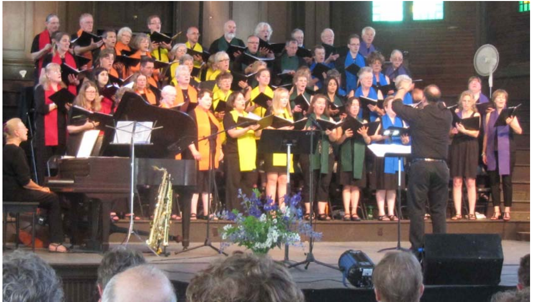
The combined choirs gave us rainbow of song at the Capital Region UU service on June 2 at the Round Lake Auditorium!