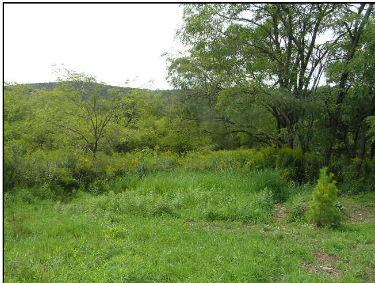
Greensprings Natural Cemetery Preserve

Funeral director Amy Cunningham, who spoke at the Memorial Society's annual meeting at FUUSA in 2013, writes, "Some people think cremation is 'greener' than burial because cremation generally requires no cemetery space. Actually, . . . you can be protecting rural property by burying yourself in it. Cemetery laws prohibit highways or shopping malls from coming to land that has deceased people in it,