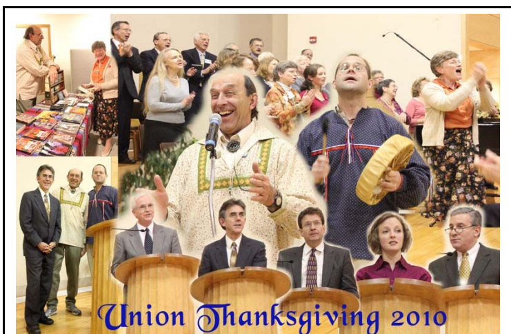
The Union Thanksgiving was celebrated at FUUSA this year with a medley of speakers from the four congregations.

The UU Weekend Committee has cancelled its planned fundraising dinner (previously announced for January 29) due to scheduling conflicts. Thank you to all who marked this date on their calendars and planned to attend. We are working on a terrific UU Weekend for Oct. 14 – 16, 2011-- so that is a date you should hold! - UU Weekend Committee