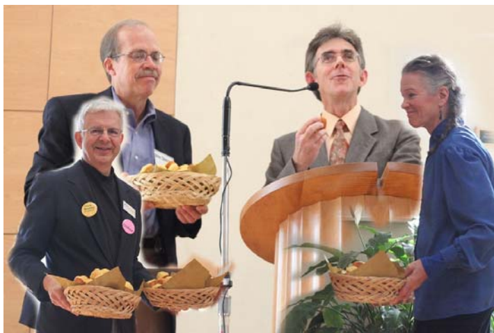
And the corn muffin communion on Sunday morning!