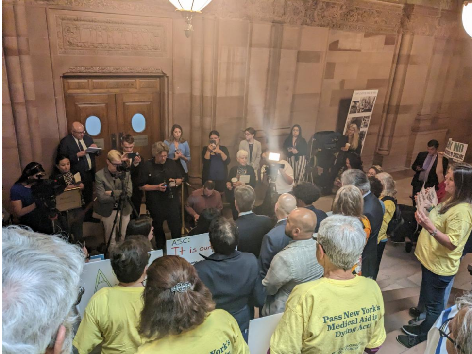
Image Description: Albany UUs advocating at the Capitol for the Medical Aid in Dying Act